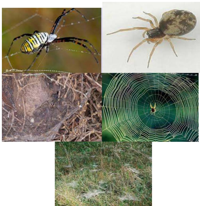
Fig. (2): Spider species and their webs