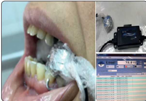
Fig. (3) Measurement of biting force using I loadstar sensor