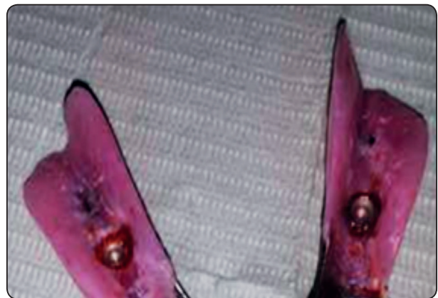
Fig. (2) Removable implant retained partial overdenture by ball attachment in second premolar region

Maximum biting force was measured for both groups using I loadstar sensor (loadstar sensors.453 Riverdale Drive, Mountain view, CA94043). The sensors was prepared and calibrated, the patients were seated upright to ensure vertical direction of applied force. The dome shaped top of the sensors was placed in the occlusal embrasure between the upper premolar and the first molar on one side of the mouth ( fig 3 ) as this area allows the patient to exert maximum controlled force, (14) while on the contralateral side a cotton rolls was placed , then the patient was asked to exert maximum biting force. This method was applied to the right and left side of the patients.