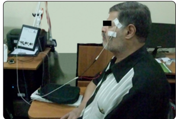
Fig. (4) Electromyogram measurement