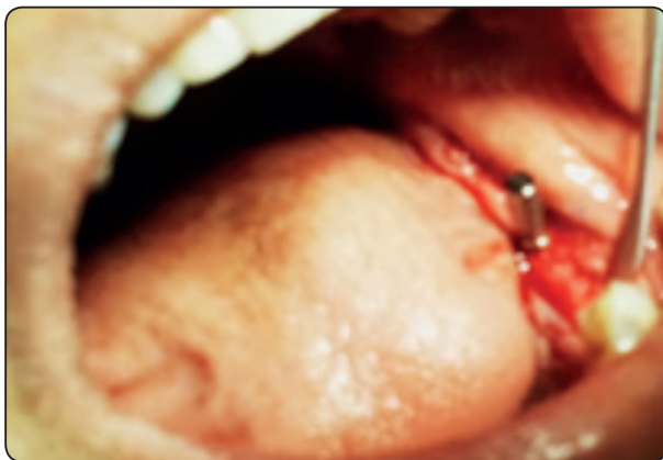
Fig. (1) Surgical placement of implant in second molar region

All the patients undergone guided surgical procedures and implant installation using bone supported computerized surgical guide after flap elevation ( fig. 1 ) in the predesigned sites.