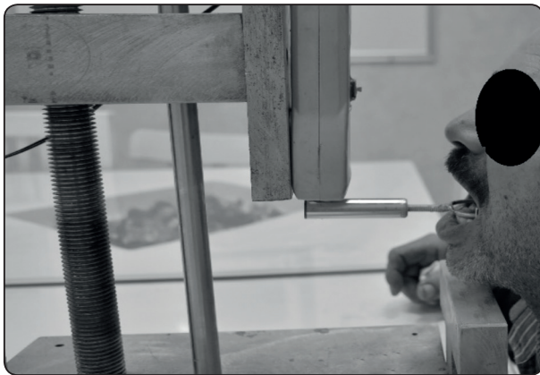
Fig. (2) Show the patient facing the force meter while measuring.