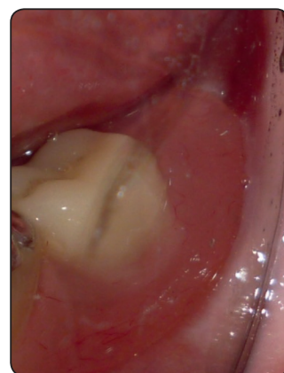
Fig. (2) Denture base covering the retro molar pad.