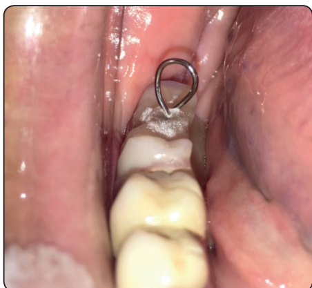
Fig. (3) A wrought wire loop fixed by self cure acrylic resin