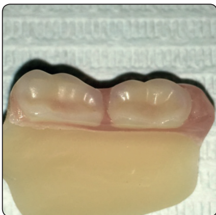
Fig. (1) Denture base extended just to the anterior border of the retro molar pad.