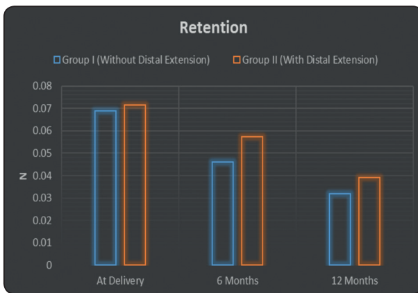
Fig. (5): Bar chart revealing retention values for both groups

M; Mean, SD; Standard deviation, P; Probability Level *insignificant difference