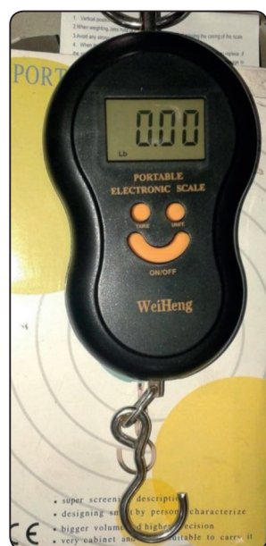
Fig. (4) portable electronic scale force meter .

In this study, retention of the lower removable partial denture was examined and measured by the digital force-meter, using Acetal resin removable partial denture with different denture base extension group I (without distal denture base extension), group II (with distal denture base extension covered the retromolar pad ).