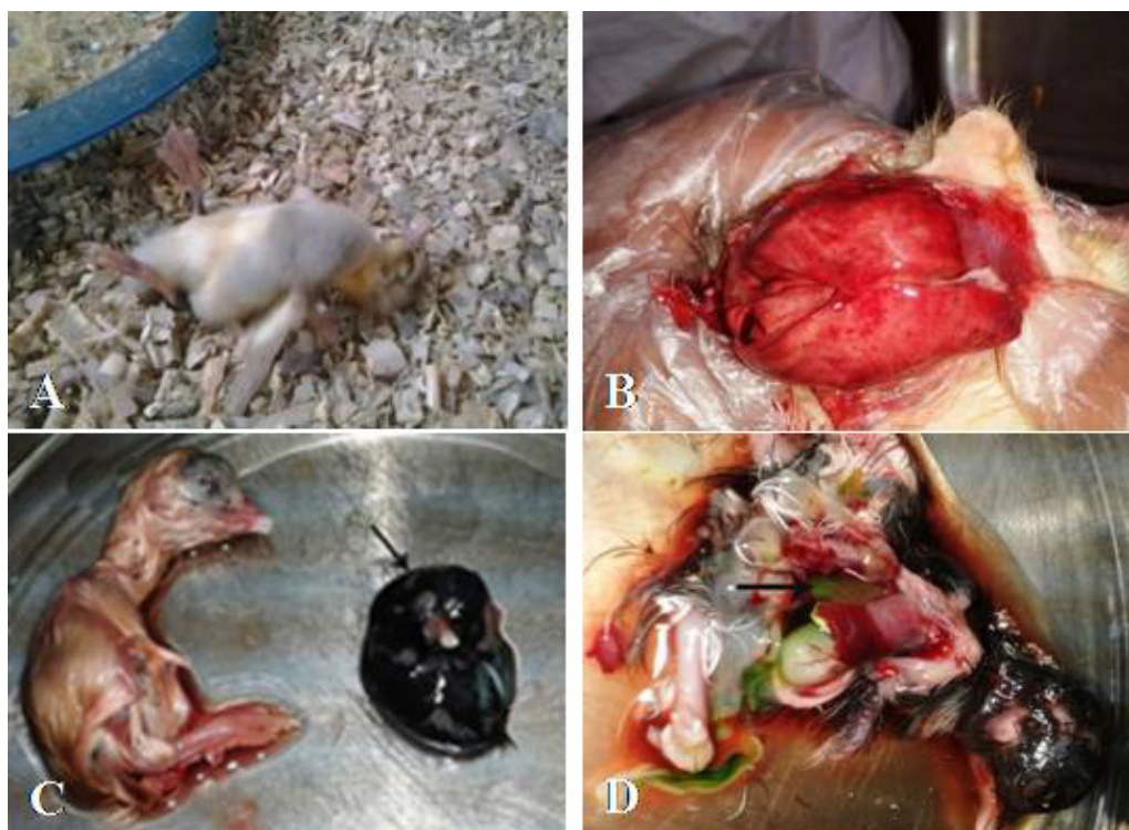
Figure 1: (1 A-D): A: Pekin ducklings, 6 days-old, flock number 9 showing opisthotonos. B: Liver of pekín ducklings, 11 days-old, flock number 8, showing petechial haemorrhage. C: Dead embryo of flock number 12 showing stunting 7 days PI compared with the control (arrow head). D: Liver of dead embryo showing greenish discoloration (arrow) in flock number 12

The examined ducklings under current study were suffering from nervous signs including ataxia followed by opisthotonos (loss of balance falling on their sides and kick spasmodically) then death (Figure 1 A). The postmortem findings appeared mainly in the liver, which was enlarged and displayed distinct petechial and/or ecchymotic hemorrhages (Figure 1 B).