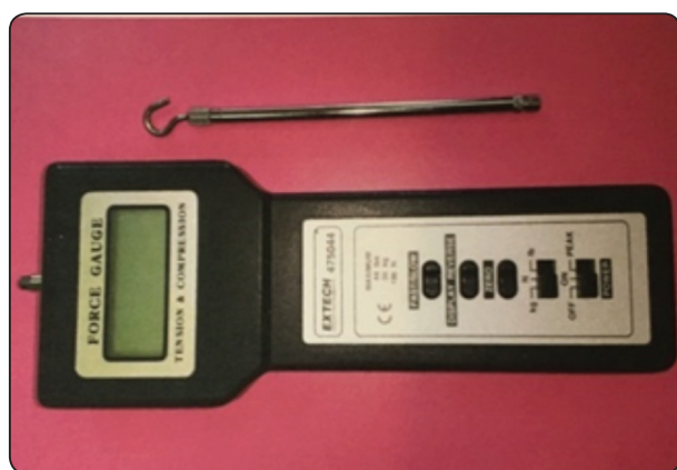
Fig. (2) Digital force meter