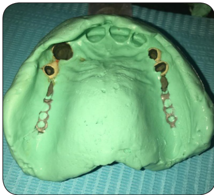
Fig. (5) Pickup impression