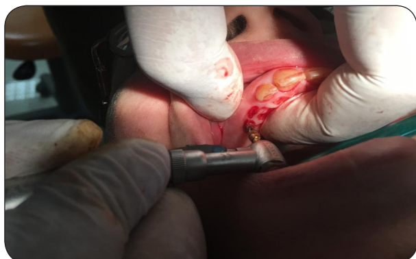
Fig. (2) Osteotomy with successive drills

Osteotomy was made using successive drills at predetermined implant site and Implant fixtures were inserted in place and titanium cover screws of the same diameter of the implant were screwed into implant fixture. The flap was irrigated with saline, repositioned and secured by interrupted sutures. (Fig.2)