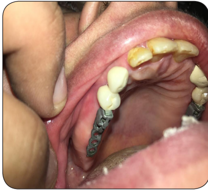
Fig. (4) Try in for framework