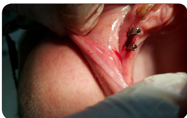
Fig. (3) Implant abutments in place

The cover screw was unthreaded and a healing collar of 4mm length was selected, inserted and threaded into the implant by the aid of implant driver and tightened well.(fig 3)