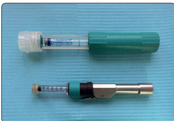
Fig. (1): INJEX syringe

Detailed information about the use and application of the INJEX device (fig.1) in delivering local anesthesia can be found at the manufacturers' website (21) . According to this, the INJEX may