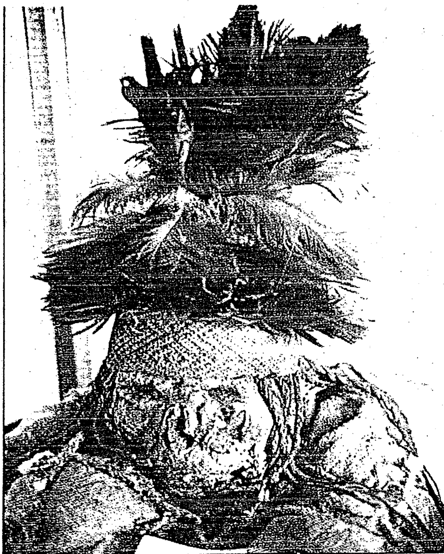
THE HEAD OF A MUMMY, NEARLY 1000 YEARS OLD, FOUND IN A GHIRABAYA SITE IN PERU. NOTE THE PRESERVATION OF THE FEATHER HEADDRESS