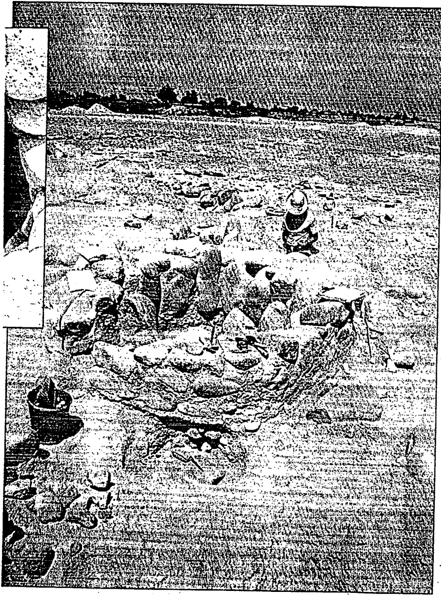
AT THE ESTEQUINA SITE IN PERU (1000-1300 AD) A STONE CRYPT WITH A SUBSURFACE TOMB IN THE FOREGROUND