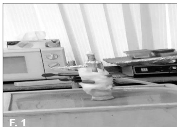
Fig.1: Feeder membrane equipment

Feeder membrane preparation: The feeder membrane (Fig. 1) consisted of two tubes, first one for positive blood meal surrounded with the second one for the current water which connected with water bath at 37^{\circ}\text{C} to keep the blood temperature. The 1 st tube with two ends, the bottom, covered with chicken membrane and the upper covered with a piece of cotton after a blood meal entered. The 2 nd tube with two ends also, for income and outcome the current water.