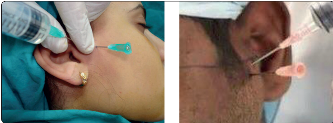
Fig. 3 (A) (B) Arthrocentesis for 2 patients in the control group .

All patients undergo the TMJ lavage procedure under local anesthesia using 100 ml of Ringers lactate solution; the technique was standardized for all patients. The skin surface of the preauricular region was disinfected with povidone iodine solution. A canthal-tragal line was drawn and two points were marked to be used as the entry and exit for the lavage solution: the first at 10 mm anterior and 2 mm inferior; the second at 20 mm anterior and 6mm inferior to the tragus on the drawn cantus-tragus line. The first point corresponded approximately with the posterior wall of the condylar fossa, which was also further confirmed manually by palpation over the area while manipulating the mandible in its range of motion. Auriculotemporal anesthesia was performed with (4% articaine, adrenaline 1/100,000) which was also injected into the joint cavity. Two 20-gauge needles were placed at the entry and exit points for washing. The arthrocentesis was performed with 100 mL of Ringers lactate to eliminate the catabolites present in the synovial fluid. The mandible was then gently manipulated in the vertical, protrusive and lateral excursions to free the joint's compartments.