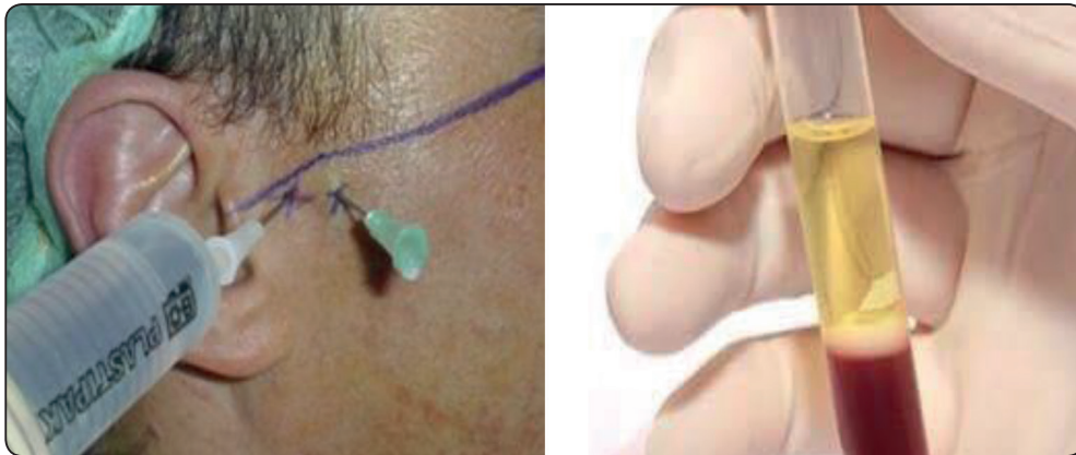
Fig. 1 (A) Arthrocentesis for a patient in the PRP group (B) The PRP extract used for injection in the TMJ

The main outcome variables including: pain was measured using VAS (Visual Analogue Scale) evaluations, VAS has 2 ends: one end or 0 is marked as “no pain”, and the other end or 10 is marked as “the worst imaginable” pain, MMO measured as the distance between the upper and lower incisors the patient could obtain without having any type of pain and it is expressed in millimeters, presence of any self-perceived pathologic noise with joint movement following scale: one end or 0 is marked as “no noise”, and the other end or 10 is marked as “the worst imaginable noise”. These data were recorded preoperatively and at intervals of 6 and 12 months postoperatively by the same surgeon, The surgeon is not blinded as to the treatment groups, also data regarding the age and gender of the patient were collected to assess the influences of demographic features on treatment effectiveness.