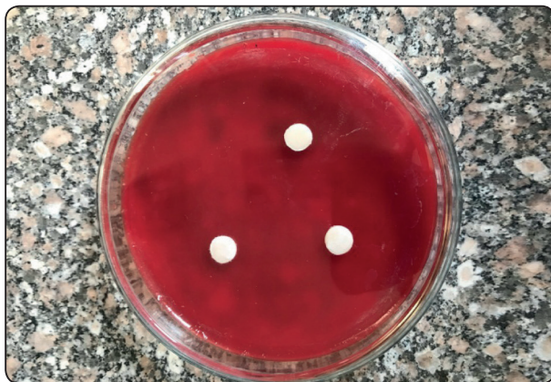
Fig. (1) : specimens planted in agar plate

the inhibition halo formed around the specimen. This measurement was taken after 24 hours, 48 hours and 1week. A mean and standard deviation were determined per group. Data were explored for normality using Kolmogorov-Smirnov test of normality. And one way analysis of variance (ANOVA) test was used to compare between groups. This was followed by Tukey post hoc test for multiple pairwise comparisons.