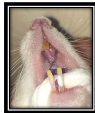
Figure (1) : Rats' tooth after bonding procedures

Bonding brackets on rat's teeth was excluded because bonding failure and subsequent rebonding with orthodontic adhesive containing TiO 2 -NPs affects standardization and concentration levels of tested material among rats as observed in a similar study (7) . So it was decided to use orthodontic adhesive directly on tooth surface. A small increment of orthodontic adhesive was placed on the middle-middle third the lower left central incisor for both groups. Modified TiO 2 NPs orthodontic adhesive was used for bonding of the study group while control group was bonded with unmodified conventional orthodontic adhesive. Tooth of choice was dried and etched with 37% phosphoric acid for 20 seconds then rinsed with water, a thin layer of bond was applied on the tooth surface and small increment of orthodontic adhesive was applied by plastic instrument. Then a light cure was applied perpendicularly on the tooth surface for 20 seconds.