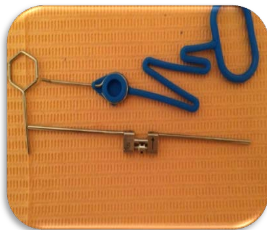
Figure 4: mandibular arch expansion screw