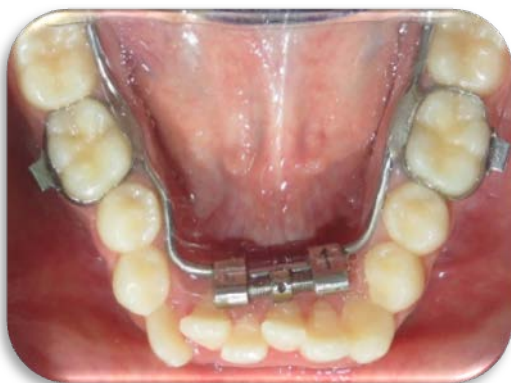
Figure 1: Occlusal view showing William's Expander

The CBCT images were acquired using a Planmeca Promax scanner. A scout view was obtained and adjustments were made to ensure that all patients were correctly aligned in the scanner according to adjustment light beam before acquisition. The machine was supplied with Amorphous Silicon Flat Panel Sensor. A wooden spatula was placed between the jaws to avoid occlusal contact. After acquisition, data were exported and transferred in DICOM format and downloaded via a Compact Disk (CD) to a personal computer for linear measurements, where in vivo Dental software was utilized. Serial of steps were followed to standardize the measurements in all scans.