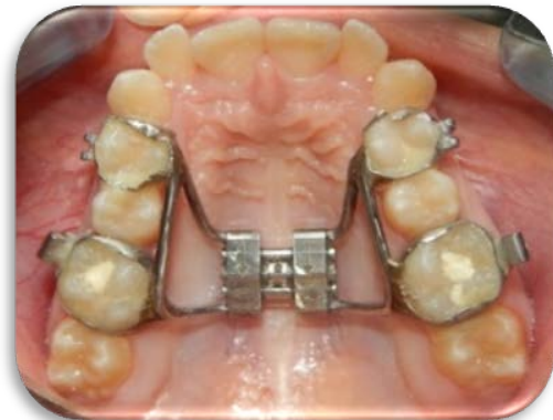
Figure 6: occlusal view showing Hyrax expander