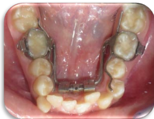
Figure 2: Occlusal view showing Skeletal expander