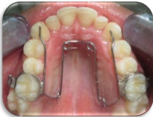
Figure 5: occlusal view showing Quad helix expander