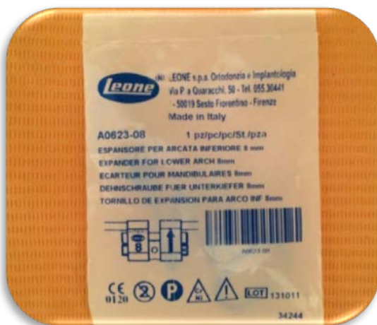
Figure 3: expansion screw package