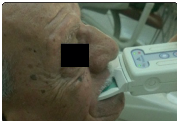
Fig. (1) Patient was sitting in a relaxed upright position in the dental chair while sensor held parallel to occlusal plane.

chair. The sensor was held consistently in the same position with respect to the teeth. It was aligned to be parallel to the occlusal plane and centered on the midline between the central incisors (Fig. 1).