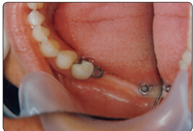
Fig. (2) Crown with ERA attachment