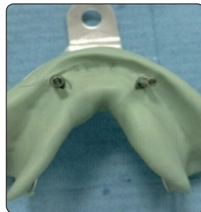
Fig. (2): Closed tray impression with transfer coping and implant analogue in place.