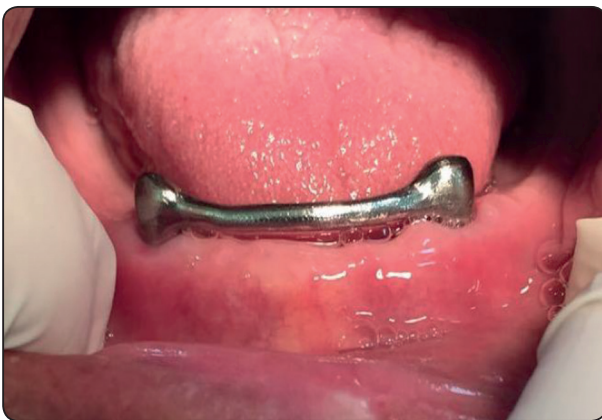
Fig. (3) The two splinted Mini implants

For group II patients: Auto-polymerizing acrylic resin was applied into the depressions of the mandibular denture corresponding to the ball abutments sites and the denture was fully seated in the patient's mouth. With the maxillary denture in place the patient was guided to close in centric occluding relation till complete curing occurred.(Fig. 3-6)