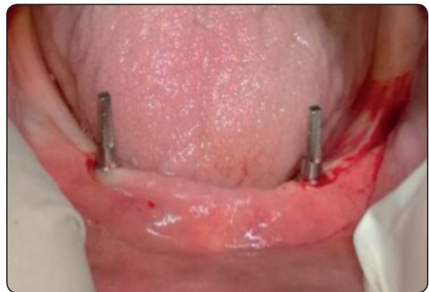
Fig. (1): Mini implant with square head

Closed tray impression was made with rubber base putty impression material using plastic transfer coping and implant analogue. (fig.2) Stone was poured to get cast with implant analogue in its place representing patient's mouth.