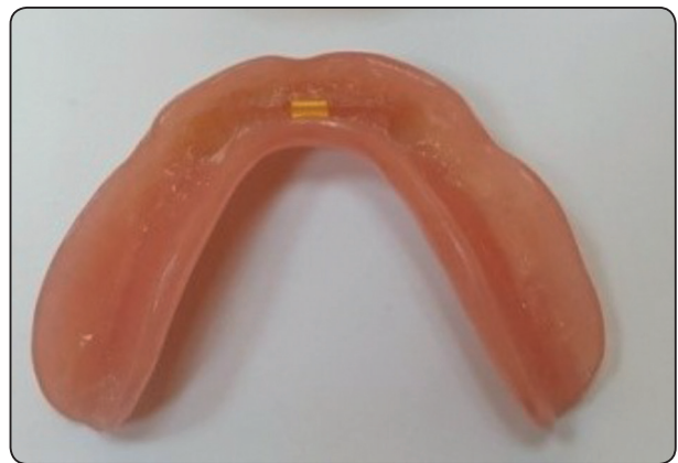
Fig. (4) clip for splinted Mini implants