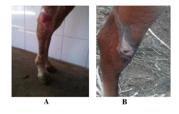
Fig (4): Healing stages of a non-infected cutaneous wound in a horse treated with Green ZnO NPs gel after surgical debridement. (A) 2.5 years old horse suffering from a non-infected wound at the right hind limb. (B) The same case after four weeks of treatment by green ZnO NPs gel showed an amazing result to the owner in a very mobile part in his horse.

Fig (3): Healing stages of an infected cutaneous wound in a donkey treated with chemical ZnO NPs gel after surgical debridement. (A) 1.5 years old male donkey suffering from an infected wound at the right thoracic region after surgical debridement. (B) The same case after two weeks of treatment by chemical ZnO NPs gel showed a decrease in wound size and the tendency for closure (C) The same case after 21 days of treatment showed non-infected and decreased wound size.