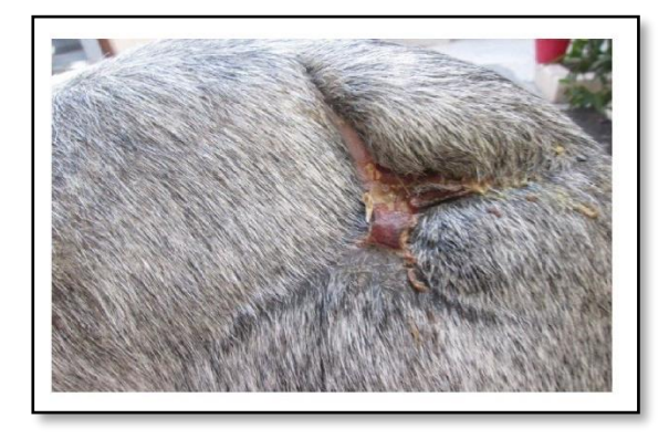
Fig (2): Photograph of a traumatic infected wound. Where, a male donkey suffering from an infected wound at the right lateral side of the abdomen perhaps as a result of owners` hitting. Photograph was taken before any surgical debridement.

By the 1st week, the visible signs of wound infections were disappeared in most cases as shown (Figure 2, 3, 4). The two infected wounds treated with green ZnO-NPs gel characterized by severe and moderate signs of infection which disappeared after only one week of gel application. While, the four infected wounds treated with chemical ZnO-NPs gel characterized by mild and moderate signs of infection in two cases which disappeared after one week of gel application, and severe signs of infection in the other two infected cases which disappeared after two weeks of gel application.