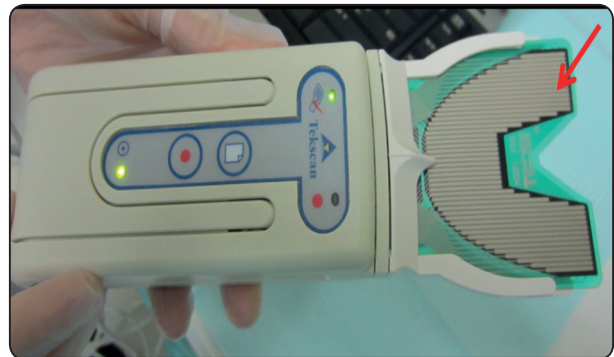
Fig. (1) T-Scan III sensor (Red Arrow) mounted in the T-Scan III holder and handle

sensors are available. Sensor size was chosen to suit the patient's dental arch. Following manufacturer's recommendation, a proper sensitivity range was established before any occlusal data acquisition. 30, 39 Sensor conditioning procedures through 2 to 4 test closures 21,23 were also done for each participant.