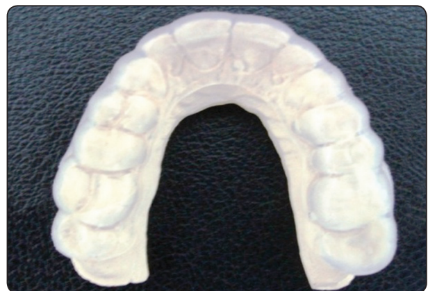
Fig. (2) Soft splint

Group A: For the soft splint, a vacuum pressure molding device was used for fabrication with 2-mm-thick of resilient vinyl sheets measuring 13 cm. The rubber sheet was completely and properly-adapted to the cast in the vacuum former. The sheet was removed, and sharp scissors were used to trim the splint edges. The palatal portion of the splint was removed to obtain the shape. fig(2)