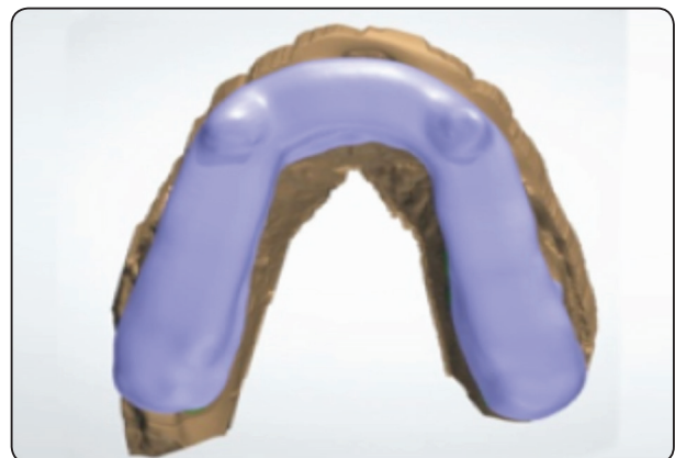
Fig. (5) Flat bar with ramps in the canine region constructed over the shell to achieve a flat surface to contact only with the buccal cusps of the lower teeth.