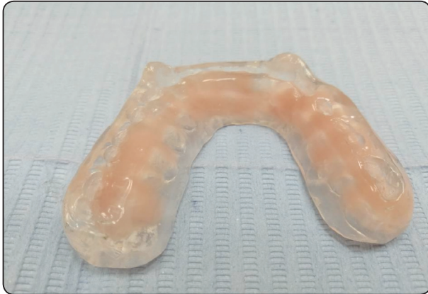
Fig. (3) Hard splint

Group B: For the hard splint, self-curing transparent acrylic resin was used to fabricate the splint in the form of a flat anterior bite plane with a thickness of 2–3 mm, which separated the posterior teeth while allowing contact between the anterior teeth. fig(3)