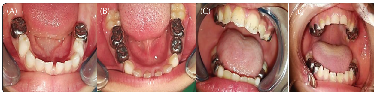
Fig. (2) Photographs represent the 4 groups of the study, respectively (A-D).

The occlusal surface of SSCs was reduced by 1–1.5 mm and the occlusal third of the buccal surface was beveled using a diamond wheel bur and round of all line angles. The proximal contacts were opened at the appropriate depth in a single sweeping motion, using tapered fissure bur. The properly-selected size of SSCs was just trimmed to flat edges, smoothed, fitted, re-contoured, and crimped. All margins were checked for an accurate fit. All SSCs were cemented with zinc polycarboxylate luting cement, the excess was removed by a sharp instrument, and the occlusion was checked. All treated primary molars underneath the SSCs were 70% pulpotomy,