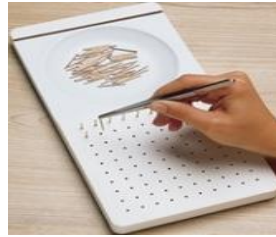
Figure 2. O'Connor Tweezer Dexterity.