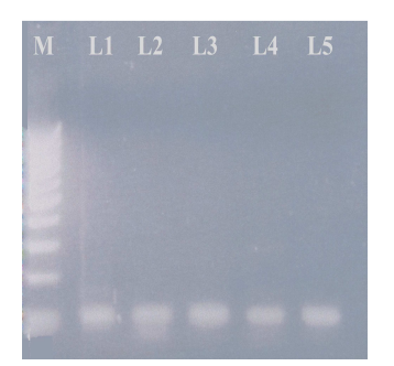
Fig. (6): PCR of ( Chlamydiophila abortus ) DNA from formalin-fixed and parafin embedded tissues of aborted ovine foeti. PCR products were separtaed on 1.5% agarose gel and stained with ethidium bromide M, 100 bp ladder marker; lane 1-5 specific C. psittaci PCR product (119 bp detected).

samples of placenta and aborted foeti of aborted ewes from serologically