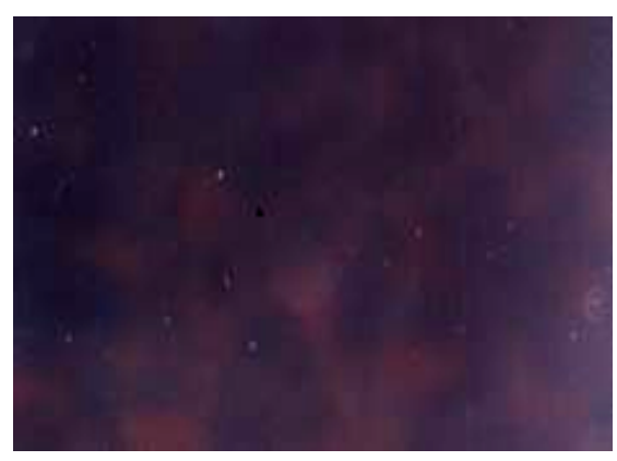
Fig. (5): Negative IFA reaction of T.annulata Schizont antigen with serum of control negative animals