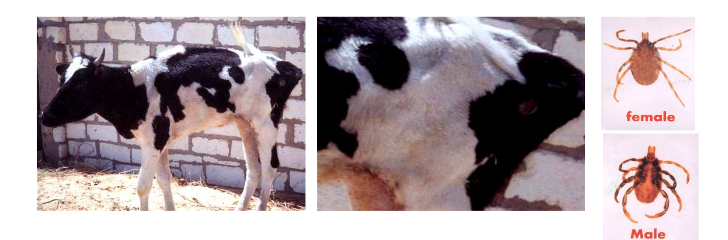
Fig. (1,2,3): 1 year old cross breed calf infected with theileriosis showed pronounced emaciation and enlarged prefemoral lymph node .There is ticks infestation( H. a.anatolicum ) on the perneal region.