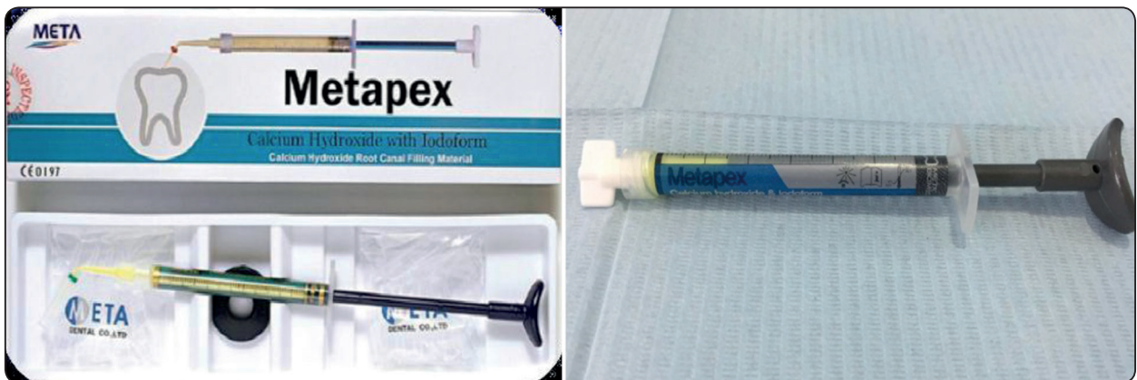
Fig. (1): Calcium Hydroxide iodoform (Metapex).

Treated children were recalled at 3, 6 and 12 months postoperatively to assess their treated primary molars clinically (Figs. 4a&b and Fig. 5a,b&c) and radiographically (Figures 6a,b&c) according to the set criteria. Extraction was planned to be carried out if clinical failure occurs in terms of evidence of pain, recurrent abscess and/ or abnormal mobility.