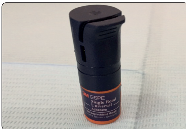
Fig. (2): Bonding agent (3M ESPE, USA).