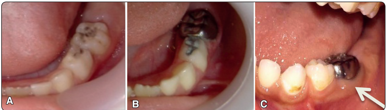
Fig. (5) (a): Preoperative clinical picture. (b): Postoperative clinical picture. (c) Postoperative clinical picture showing abscess.