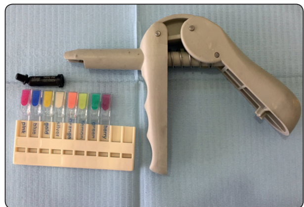
Fig. (3): Tooth-colored compomer (Twinky-star-Voco).