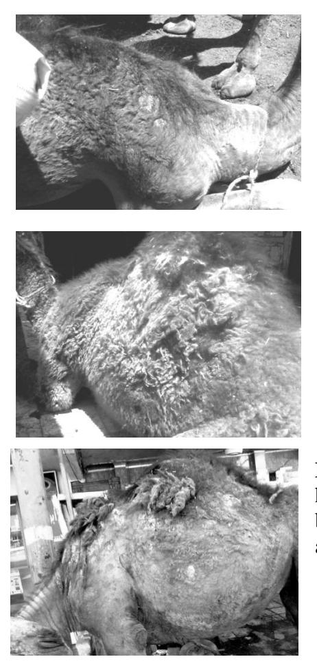
Fig.1: A young camel calf has Crusty and hairless lesions on the shoulder.

Young camels' between1-2 years old or less were more commonly affected than mature healthy camels. Signs of emaciation and fatigue appeared in most affected animals.