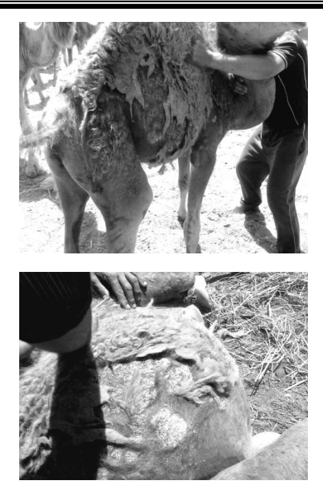
Fig. 4 : Affected camel showed heavy incrustation on different parts of the body and progressed down to belly and legs.

Fig. 5: A prominent grayish white accumulation of scales on the belly difficult to pull out of the skin (thick and heavy encrustation) due to severe dermatophytosis.