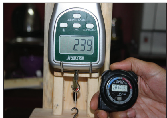
Fig (3): force calculation after 1 minute.