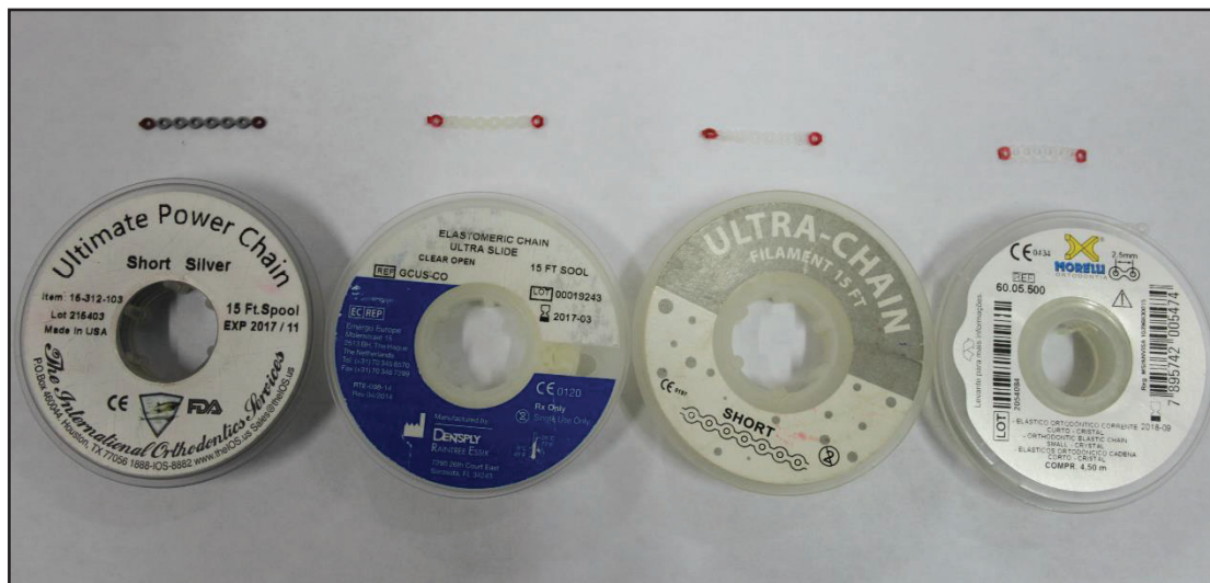
Fig (1): power chain samples.