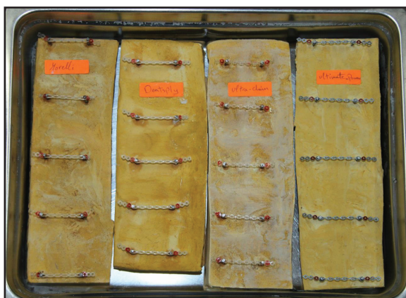
Fig (2): stone blocks with steel pins.