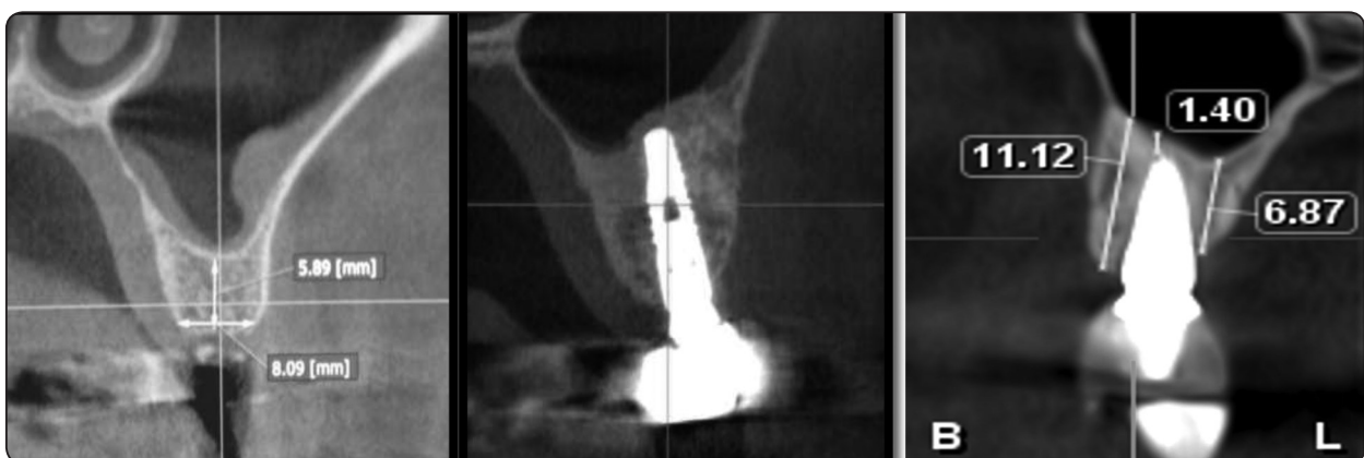
Fig. (2) The radiographic measurements of the alveolar ridge height

Data were fed to the computer and analyzed using IBM SPSS software package version 20.0. Data were fed to the computer and analyzed using IBM SPSS software package version 20.0. (Armonk, NY: IBM Corp). The Kolmogorov- Smirnov, Shapiro and D'agstino tests were used to verify the normality of distribution of variables, Comparisons between groups for categorical variables were assessed using Chi-square test (Fisher or Monte Carlo) . Student t-test was used to compare two groups for normally distributed quantitative variables. Mann Whitney test was used to compare between two groups for abnormally distributed quantitative variables. Significance of the obtained results was judged at the 5% level.