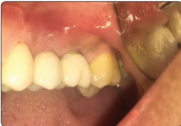
Fig. (3) Final restoration 2 nd premolar & 1 st molar

The mean height of grafted alveolar ridge had no statistical significant difference in the following postoperative intervals (6 th month, 1 st year and 5 th year postoperative) when compared with the immediate postoperative measurements. (table 2)