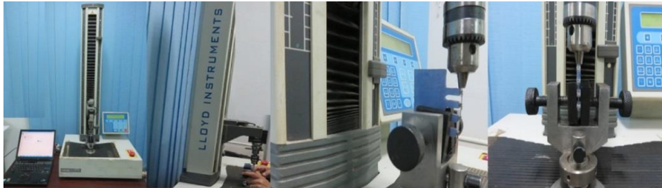
Figure (2): Friction testing using Lloyd Instrument Ltd.