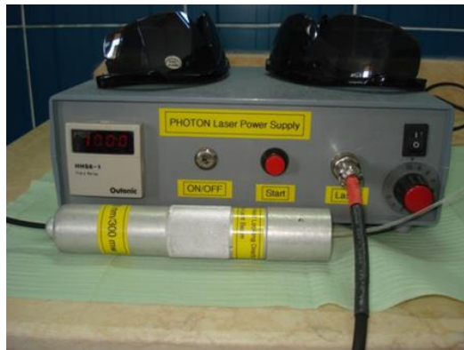
Figure 2: Laser apparatus used in study