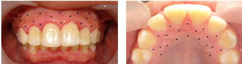
Figure 3: Graphical representation of points of laser application

Cone beam computed tomography (CBCT) was taken at two time intervals (Soredex Scanora 3D, medium FOV 75 X 100 with voxel size 0.2 mm): T1: Before the onset of en-masse retraction. T2: After the completion of en-masse retraction. The obtained data were analyzed by InVivo dental (Anatomage, San Jose, Calif). Three dimensional reconstructions were made with the use of the software. Prior to the measurement reorientation of the three planes were made with long axis of the tooth coinciding with the vertical plane. Measurements were made in the sagittal view. Reference plane was placed connecting the buccal and palatal cement-enamel junctions. The perpendicular distance was measured between the intersection of the long axis of the tooth and this reference plane and root apex (RL). (Figure 4). Area of the root surface (RA) between the reference plane and root contour was measured using the software.