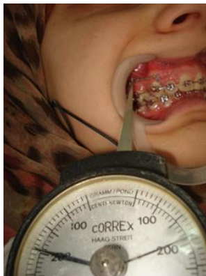
Figure 1: Force of retraction adjusted to 200 g per side

The LLT equipment used in this study was a Gallium Aluminum Arsenide (Ga-Al-As) semiconductor diode laser, continuous radiation of wavelength 810 nm and power output 20 mW. (Figure 2) The laser equipment was supplied by optic fiber with a tip of 2 mm in diameter and spectral area of 0.0314 cm 2 . Power density per point was 6.36 W/cm 2 . LLL was applied by contact method on selected points to cover the buccal and palatal mucosa of the anterior teeth; Two points on the cervical third (one medial and one distal), two on the apical third (one medial and one distal) and one on the middle third (on the center) of each involved tooth both buccally and palatally.( Figure 3) Low level laser was applied for 10 seconds per point to deliver an energy dose of 0.2 J/point. Energy dose per session was 8 J/session. Energy density per point was 6.36 J/cm 2 .The application of low level laser was set at four times per month; following the onset of en-masse retraction; immediately after activation, 3 days after activation, 7 days after activation and 14 days after activation. The same protocol was repeated monthly till desired anterior retraction was achieved.