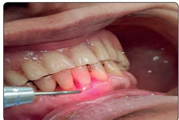
Fig. (4) Diode Laser application on exposed root