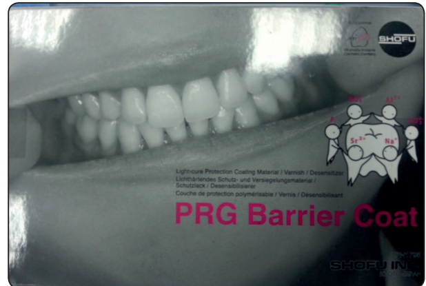
Fig. (2) The desensitizing agent 8 % Arginine-CaCO 3 used in this study

The equipment and the materials used in the study (Figure 1-4): diode laser (Sirona) application at 1 W (PW) continues wave mode(cW) for 30 seconds using 320µ fiber. NaF varnish. Each ml contains NaF I.P 50 mg equivalent to 22.6 mg of fluoride in slow release form, 22,600 ppm of fluoride, and PRG barrier coat varnish contains 8 % Arginine-CaCO 3