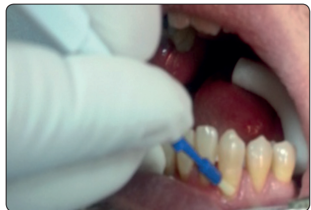
Fig. (3) Topical application of desensitizing agent