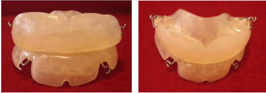
Fig (1): The class III splint used in the study

The patients were instructed to wear the appliance all day long except for meals. Patients were regularly checked on monthly basis till the complete correction of the anterior crossbite was achieved.