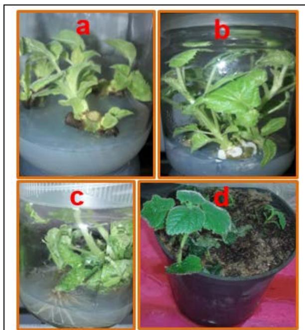
Fig. 1. Micropropagation of Paulownia tomentosa . (a) Starting stage on MS medium containing 0.5 mg l -1 BAP and 0.05 mg l -1 NAA, (b) Multiplication stage on MS medium + 2.0 mg l -1 BA + 0.05 mg l -1 NAA, (c) Rooting stage on MS medium + 0.5 mg l -1 IBA and (d) Acclimatization stage on medium containing Peatmoss : Sand (1:1).

and P. elongata (1,8). Also, Ely et al. (2013) found that explants established on MS medium with 0.2 mg l -1 BAP, 0.2 mg l -1 GA and 0.05 mg l -1 NAA; the shoot tips developed rapidly and each nodal axils produces single vegetative buds after 10-12 days. Meanwhile, Lila et al. (2016) reported that nodal explants of Paulownia tomentosa cultured on MS medium supplemented with 1.0 mg l -1 BAP and 0.1 mg l -1 NAA recorded the best initiation medium for number of leaves/explant (8-12), shoot length (2.5-3.5 cm) and number of nodes/shoot (3-4).