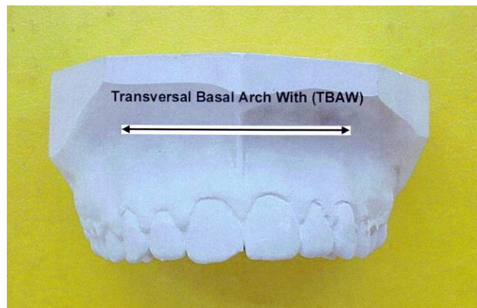
Figure 2: The measurement of Transversal Basal Arch Width (TBAW)