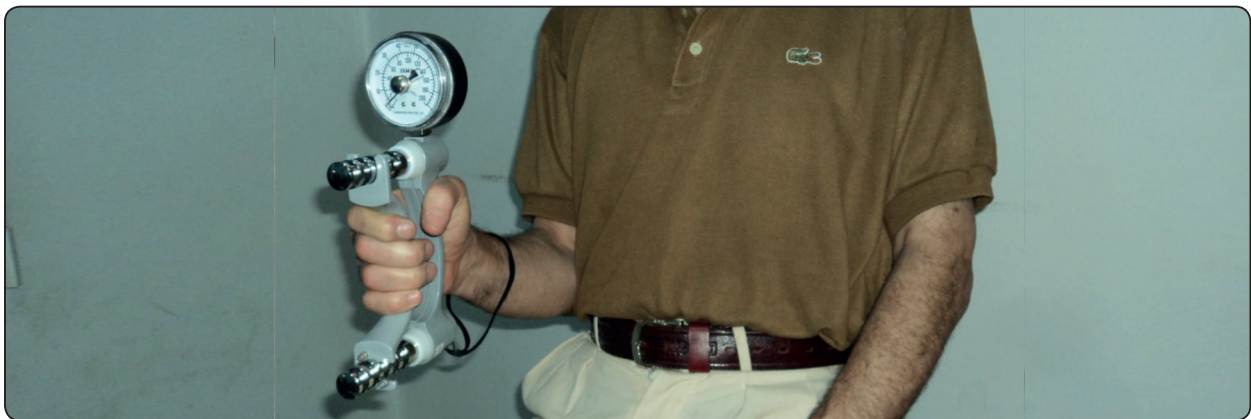
Fig. (3) Patient position for measuring hand grip strength by using JAMAR® dynamometer.