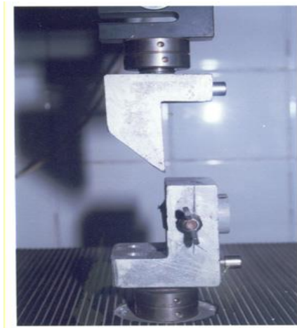
Figure 1: The sample attached to the lower part of the testing machine.