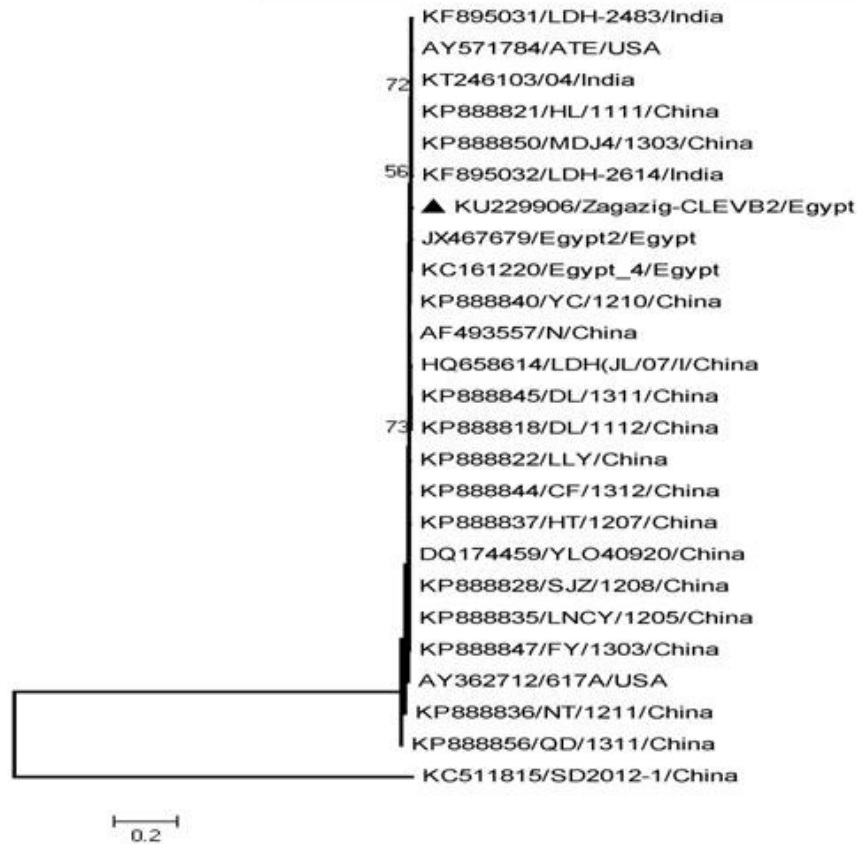
Figure 2: Phylogenetic analysis of meq gene nucleotide sequences of vvMDV isolated from Egyptian poultry flocks and other sequences available on GeneBank.

Comparison of the nucleic acid sequences of meq and tandem repeat genes of the isolates were aligned together with other MDV strains on Gene Bank. The results presented that the isolates obtained in the current study are very virulent MDV strains and with high similarity (99%) with very virulent Chinese, Indian, European ATE and Egyptian strains (Figures 2,3).