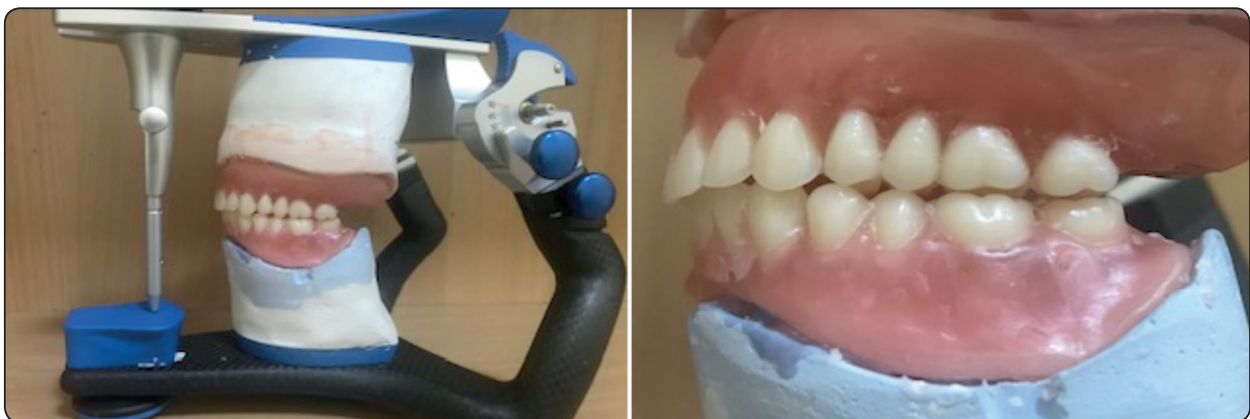
Fig. (1) setting up the posterior teeth in lingualized occlusion manner.

The surgical procedures were performed using Implant Direct (Spectra-system and Legacy) dental implants. The implant lengths were 13 mm. The selection of implant length was dictated by the preoperative cone beam radiographic measurement of bone height and width in the canine region and drilling distance, with the main concern of achieving primary stability. A total of 42 dental implants were placed. The implants were inserted under local anesthesia in one stage procedure. The implants were installed for initial torque above 30 N cm to ensure initial stability and those measured below were not immediately loaded and excluded from this study. The implant retained prosthesis was applied immediately after the placement of the implants using locator attachment. fig.(2)