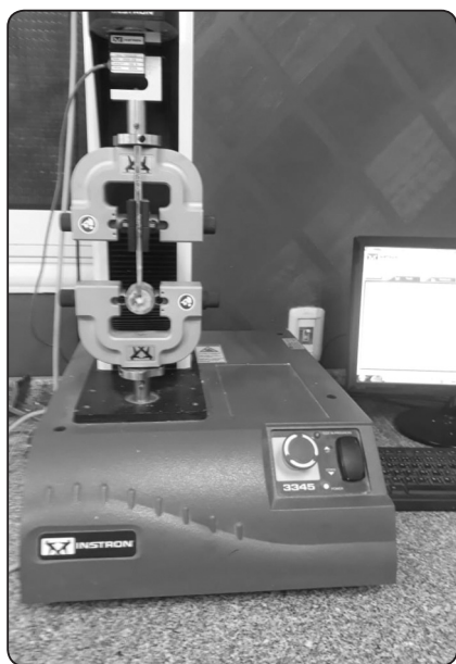
Fig. (1) Showing: Specimen fixed in universal testing machine for SBS test

The universal testing machine (Instron Universal testing machine, model no. 3345, England) was used for shear bond strength measurement at across-head speed of 0.5 mm/min. using computer software Blue Hill Instron. (Fig.1). It was recorded in MPa and was obtained by dividing the imposed force (N) at the time of fracture by the bonding surface area (approx. 20 mm 2 ). Failed areas of the specimens were evaluated. Specimens were dehydrated using solutions of ethanol, air dried, fixed on metallic stubs, then covered by thin layer of gold (Sputter Coating Evaporator, SPI Module - Sputter Carbon / Gold Coater), and examined using a Scanning electron microscope (SEM) (JEOL JSM 6510 Iv, Japan) at different magnifications. Modes of failure which were detected classified into four types: (A) Adhesive failure found between resin-dentin interface; (B) Mixed failure, in which adhesive