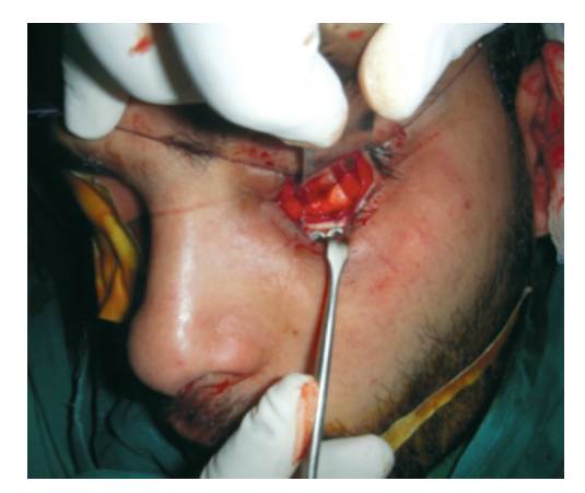
Fig. (2B): Using Onlay Rib Graft in the reconstruction of orbital floor defect.

According to Bayat et al., being an abundant and accessible autogenous source that can easily