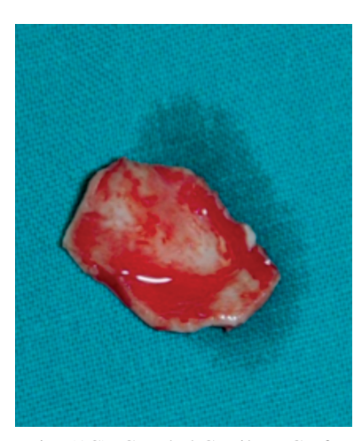
Fig. (1C): Conchal Cartilage Graft.