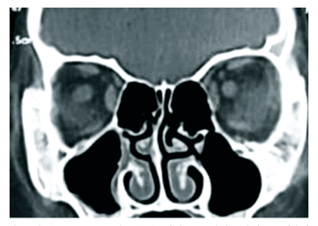
Fig. (3B): Postoperative (B) of Coronal CT defect of left orbital floor fracture reconstructed by cartilage graft.

support the orbital floor with minimal morbidity renders cartilage perfect as a grafting material. All this and more makes it questionable to why it is not regularly utilized as a reconstruction material [18].