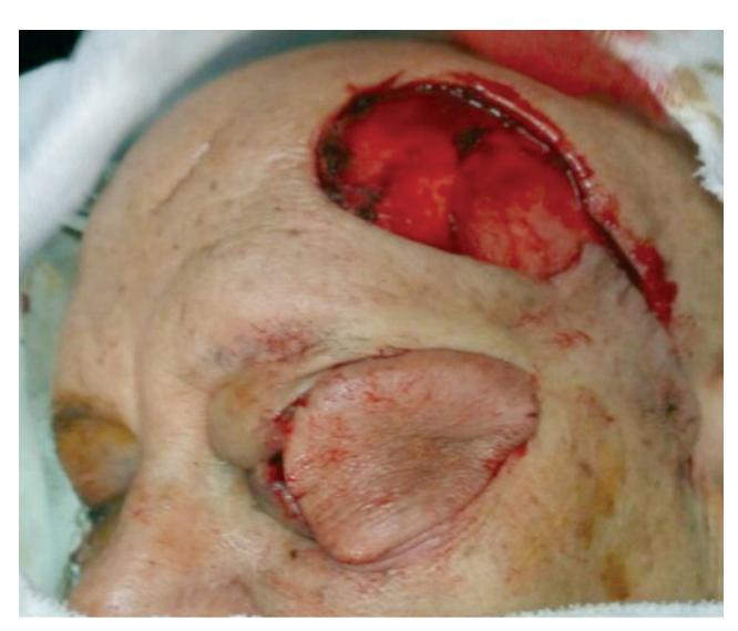
Fig. (5): The flap reached the defect without tension after passing through the created wide subcutaneous tunnel.