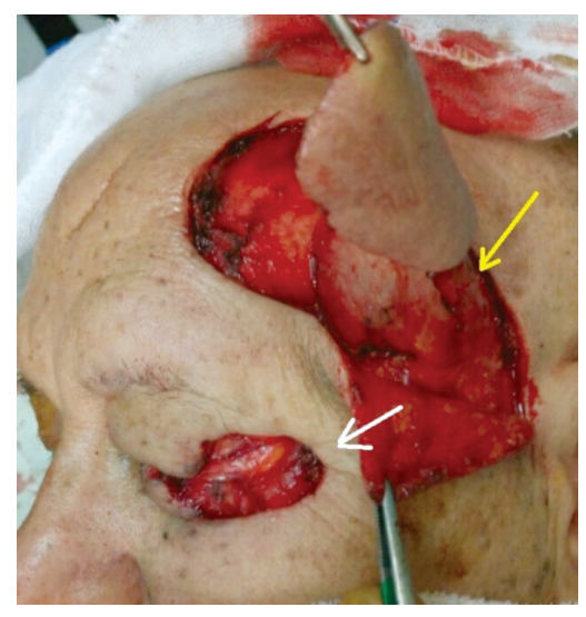
Fig. (4): The flap totally harveseted as an island attached only to the frontal division of superficial temporal vessles (yellow arrow) with tunnel created (white arrow).