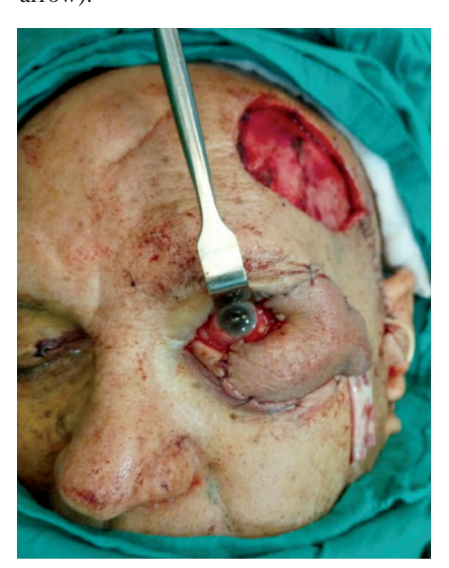
Fig.(6): The flap bifid and insetted to reconstruct both upper and lower lids with adequate palpebral fissure and lined with buccal mucosal graft to reconstruct the palpebral conjunctiva.