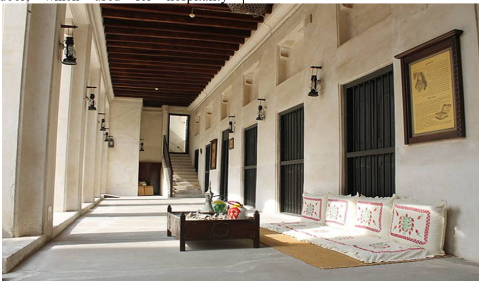
Figure "6": Heritage House, Dubai

purposes (Mohsen, Al Bayan, 2014). The floor covered with Persian rugs and all the mattresses and cushions is embroidered and ornamented. Besides mats and divans, al majlis also encompasses Al Menkal (the brazier) for the Arabic coffee together with the tray of the Dallahs (the coffee pots), the cups and some sorts of the local date's confectionery. As is customary, one of the majlis corners allocated for preparing coffee and maintaining pots. As for the walls, they ornamented with gypsum patterns and some arms of certain types, such as rifles, swords, and daggers hung thereon. Besides, the walls, above windows, in particular, ornamented with plant patterns engraved on gypsum.