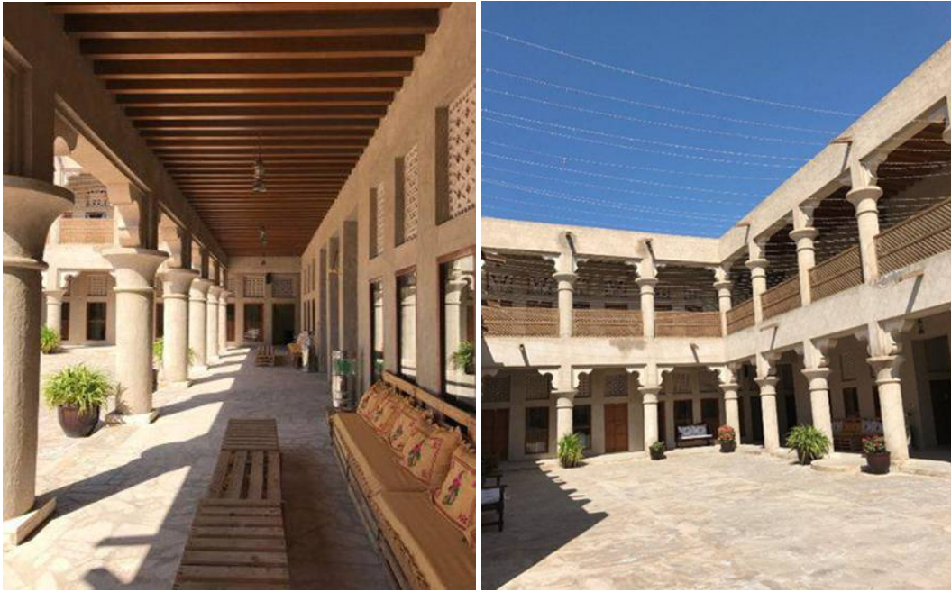
Figure "9": Al Liwan (the Hall) Sheikh Khalifa Bin Saeed Al Maktoum's House, Dubai https://www.tripadvisor.ie/Attraction_Review-g295424-d581216-Reviews-Sheikh_Saeed_al_Maktoum_s_House-

Dubai_Emirate_of_Dubai.html#photos;aggregationId=101&albumid=101&filter=7&ff=252165634