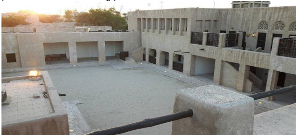
https://www.tripadvisor.ie/Attraction_Review-g295424-d581216-Reviews-Sheikh_Saeed_al_Maktoum_s_House-Dubai_Emirate_of_Dubai.html#photos;aggregationId=101&albumid=101&filter=7&ff=238428818 Figure "8": Sheikh Saeed Al Maktoum's Heritage House, Dubai