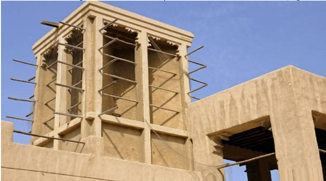
Figure "5": Wind Towers (Al Barajeel)

apertures, the existence of decorations and partitions in the room and majlises walls and the usage of various elements in the architectural formation of houses. Furthermore, among the denotations to the socio-economic position of the individual or community are the doors and windows, their various sizes and numbers, the distinctive wood out of which they are made, the decorative patterns they are fitted with which bestow aesthetic features upon their harmony and formation and which are mostly imported from abroad and the utilization of the wind towers as an architectural element, which refreshes the environment within the house (Figure: "5").