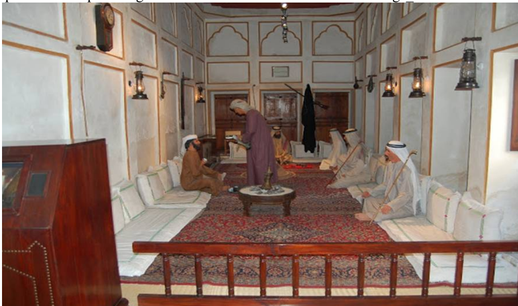
Figure "7": Al Majlis in Heritage House, Dubai

https://ar.m.wikipedia.org/wiki/%D9%85%D9%84%D9%81:Heritage_House2.JPG