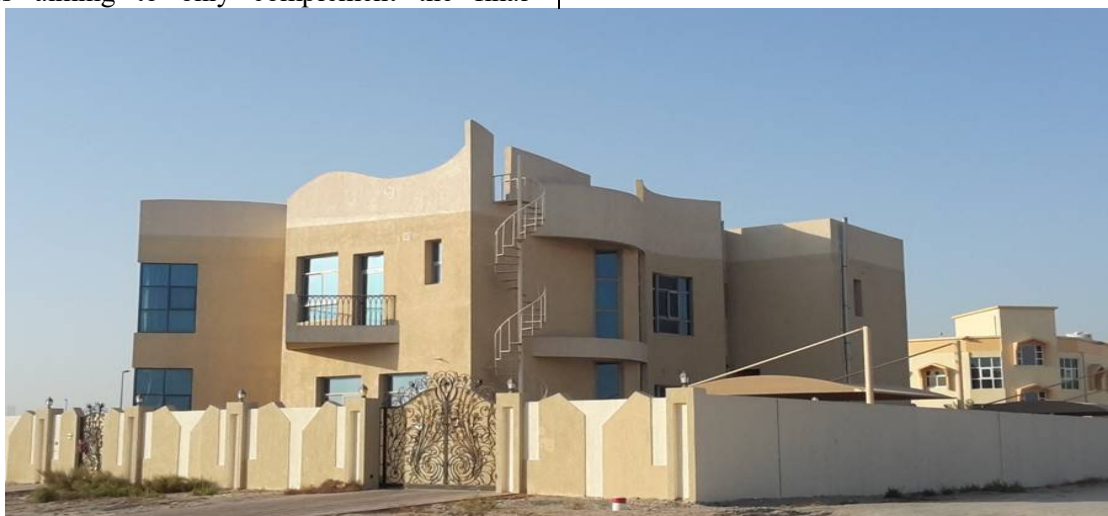
Figure "2": A villa of a modern nature