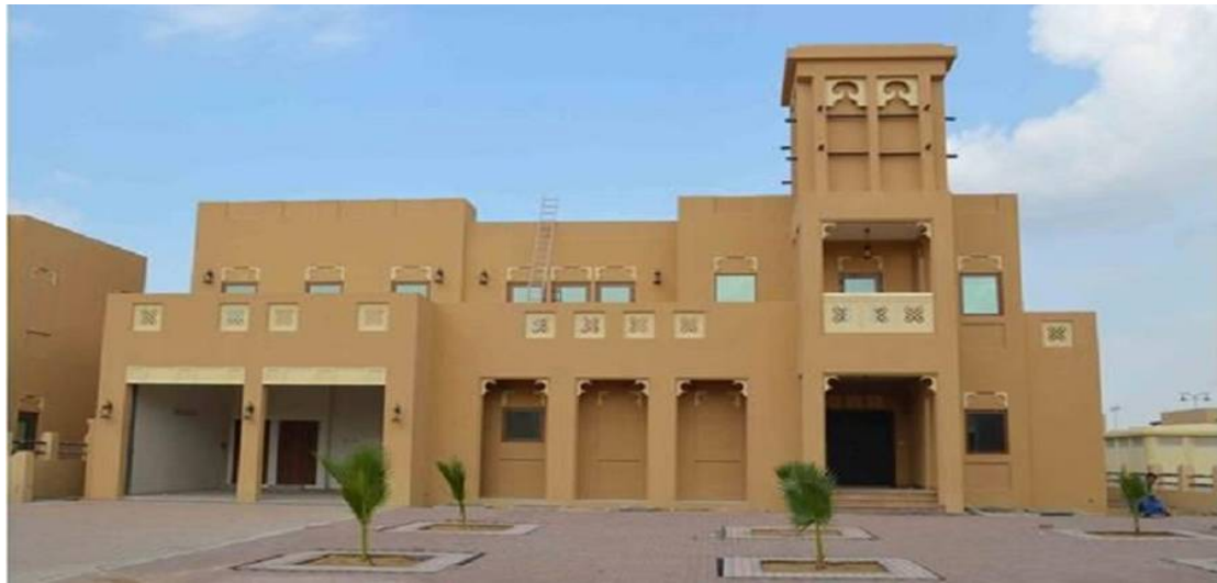
Figure "1": A Villa in Al Furjan, Dubai

http://centerhousegroup.com/property/al-furjan-villa-dubai-style-w-ms-sale/