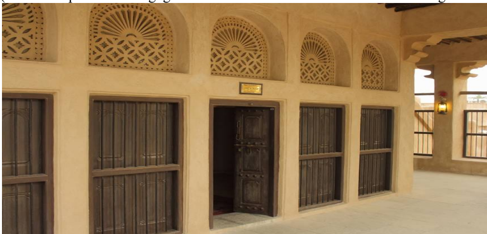
Figure "4": Traditional Architectural Decorations in Dubai