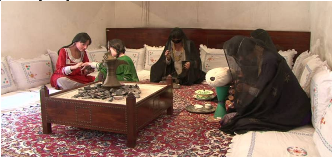
Figure "11": Women's Majlis

lightening, derived from the daylight, and artificial lightening as shown in (Figure "6"). The courtyard provides natural lightening to the house and better living ecology to the inhabitants of these types of houses(Figure "8"). Several windows enabled the sunlight to go into the rooms. Hence, each single formation element, along with its interior complementary elements, including the various contents, were subject to temporal, spatial and socio-economic evaluation as they are deemed parts of the local character along with its uniqueness and identity, which have been deeply rooted throughout ages and become the constituent element of the characteristics of the region and its residents