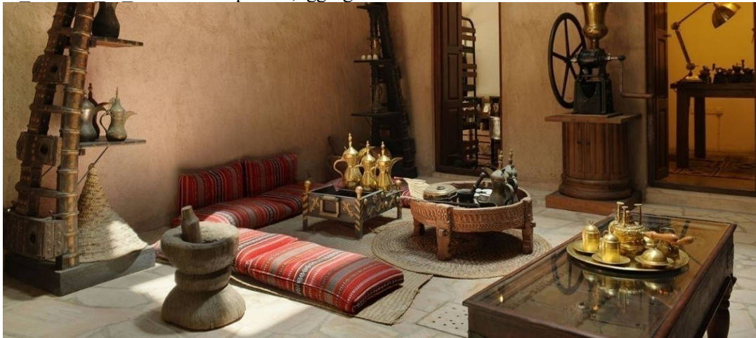
Figure "10": Main Sitting Room

Dubai_Emirate_of_Dubai.html#photos;aggregationId=101&albumid=101&filter=7&ff=252165634