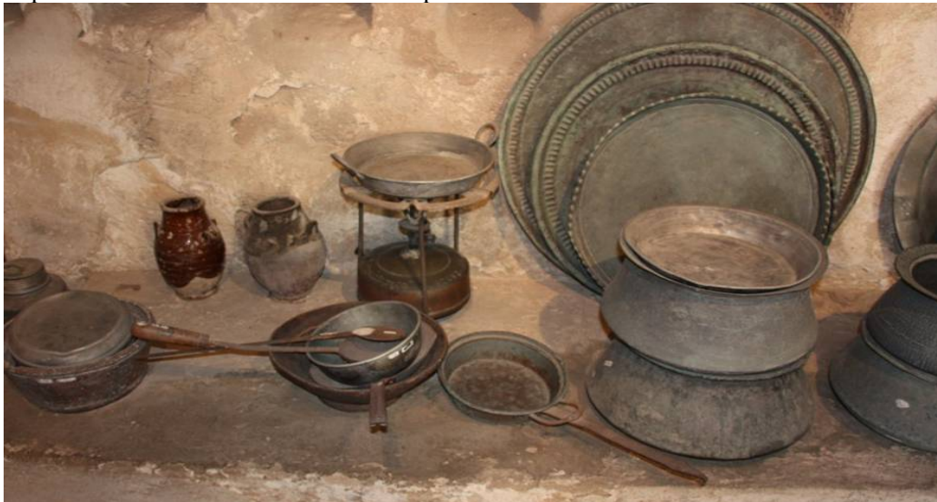
Figure "12": Traditional Cooking Utensils

https://www.shutterstock.com/video/clip-19506607-dubai-uae---circa-013-mcu-life-size