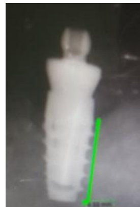
Fig (2) bone volumetric change assessment

Bone density was measured, where three lines were drawn parallel to the mesial and distal implant surfaces. The first line extended from the first thread of the implant to the implant apex passing parallel to the implant flutes and perpendicular to the implant apex. The second line was one millimeter apart, equal, and parallel to the first line. The same procedure was repeated for the third line. Bone density along each of the three lines was recorded, and then the mean value of the three readings was calculated for each surface. The mean values of the mesial and distal bone density. Bone height was measured from the crest of the ridge till the implant apex.