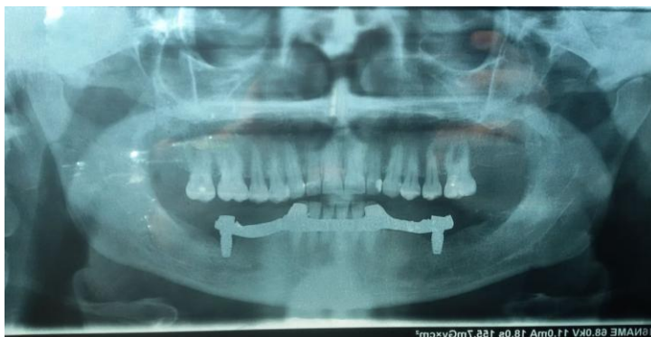
Fig (3) panoramic view to short implants with the metallic partial denture