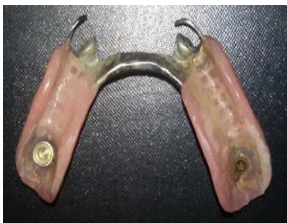
Fig (1) metal housing in the fitting surface of the partial denture

Direct digital periapical sensors were used for assessing bone volumetric changes (bone height and bone density), this record were done 3 months, 6 months and 1 year from the baseline (fig2)