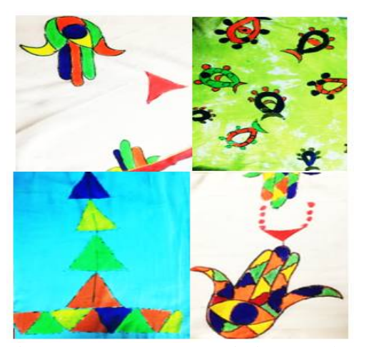
Fig .(14) represent some printing samples 3-Inspired Designs and products:

Role of sources of inspiration in the design process: