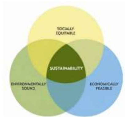
Figure (1) Illustrates the relationship between the basic axes of sustainable development

For the success of the sustainability process, these axes must be linked and integrated due to the close link among environment, economy and security. Social and economic improvements, and upgrading of social life commensurate with the preservation of basic components, natural life and long-term operations 11 .