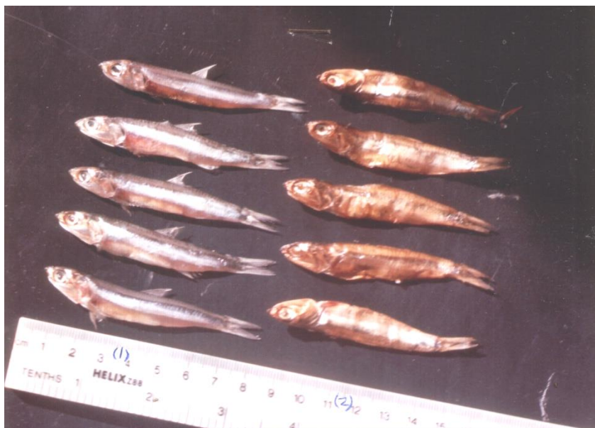
Fig (2): General appearance of fresh (1) and smoked (2) bissaria