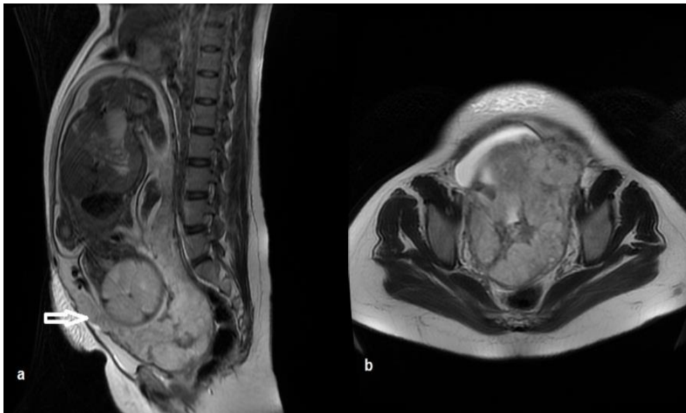
Figure 1. Female, 28 years old, pregnant at 33 weeks, presented with pelvic pain with a history of previous cesarean delivery. Placenta accreta (a) sagittal T2WI, (b) axial T2WI showing anteriorly located placenta completely covering internal os and adherent to myometrium in the lower anterior segment (arrow in a) without invasion and with preserved interface between uterus and UB. Operative findings and pathology: Placenta accreta