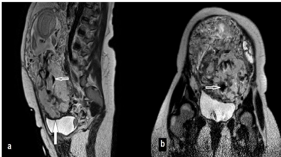
Figure 2. Female, 32 years old, pregnant at 30 weeks, presented with vaginal bleeding with a history of two cesarean deliveries. Placenta percreta (a) sagittal T2WI (b) coronal T2WI, showing anteriorly located placenta completely covering internal os with heterogeneous signal intensity, multiple low signal intensity bands (thin arrow in a and b) and markedly interrupted myometrium with loss of fat plane between placenta and urinary bladder (thick arrow in a). Operative findings and pathology: Placenta percreta