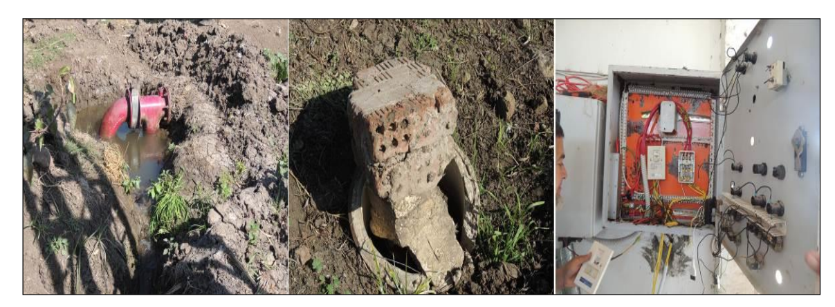
Fig. 4. Examples for poor maintenance in the improved system

maintenance is not only related to the knowledge or the capacity of farmers, but it is also related to the cooperation and the willingness of the farmers to share in the maintenance. Some operators commented about having spare parts or money for the maintenance that farmers are barely paying for the operation (El-Gamal et al 2014). Fig. (4) Presented examples on different levels, which could be observed along the entire improved areas. At Mesga level (first from the left), the farmers dredge a small stream to release the leakage from a broken pipeline to the canal. They waited long time for improvement sector to fix the pipeline although the Mesga was handed over to the farmers, and it became under their responsibility. In the second example, they used stones to stop the leakage from the valves in the improved Marwas instead of fixing or replacing it, and such situation was continued for long time as well. The third example presents the unsuitable maintenance of the electrical parts.