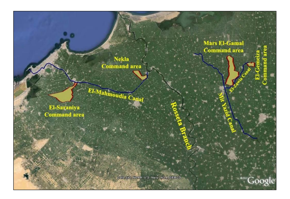
Fig. 2. The selected canals and the command areas

The investigation did not cover the five canals during each season. In the first season (winter 2015-2016), the investigation covered Nekla and Mars El-Gamal canal. The improvement was completed in the two canals within this time. El-Saraniya canal was added to the investigation in summer 2016. Canal improvement was not completed during this time. However, the investigated Mesgas in this canal was completed. In winter 2016-2017, the investigation included El-Gemeiza canal. The improvement was still in progress in the canal. The electricity was not provided to the Mesgas, and farmers were still use diesel pumps outside the pump station to pump inside the pipeline. El-Gemeiza was replaced by El-Qamahin canal in last season. El-Qamahin is related to IIP1 and it has different design characteristics, and it was completed many years ago.