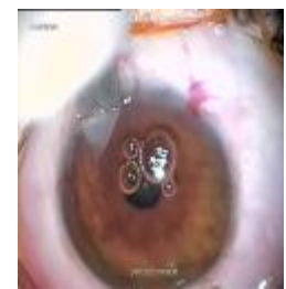
. (A): The corneal incision