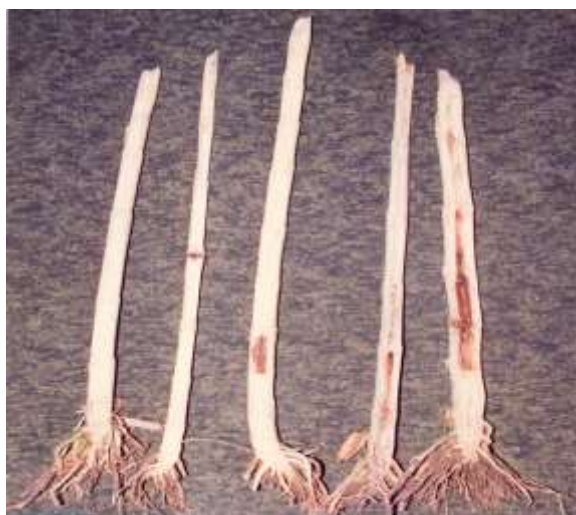
Figure 1: Different degrees of Fusarium stalk rot (1-5) in Giza 15 sorghum plants

*S = Highly susceptible, MS = Moderately susceptible, R = Resistant